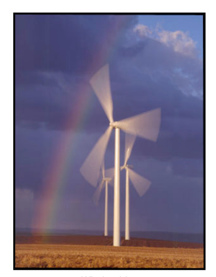
Wind turbine

Modern windmills are much more efficient at removing energy from wind when they are large. This is, in part, because then they can get energy from winds blowing at higher elevations. Some wind turbines are taller than the Statue of Liberty.