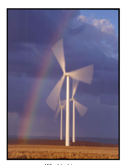
Wind turbine

Wind is generated from solar energy, when different parts of the surface of the earth are heated unevenly. Uneven heating could be caused by many things, such as difference in absorption, differences in evaporation, or differences in cloud cover. Windy places have been used as sources of power for nearly a thousand years. The windmill was originally a mill (a factory for grinding flour) driven by wind power, although early windmills were also used by the Dutch for pumping water out from behind their dikes. Many people are interested in wind power again these days as an alternative source of electricity. Pilot wind generation plants were installed at the Altamont Pass in California in the 1970s. These are more commonly called wind turbines, since they no longer mill flour.